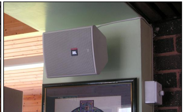
In the foyer and relay halls, additional JBL Control 25T speakers were installed with local switches for volume and on/off control.