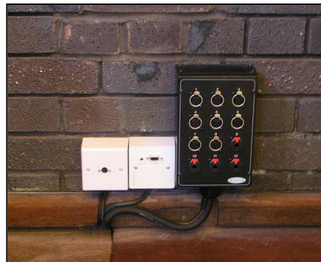
Procon AV and Kelsey audio connectivity. Inputs for musicians, laptop and video camera (S-Video).

Creative not only have a passion for Church installations, they also take personable care over every part of the system. Future compatibility and Church growth govern how each system is designed and each component is selected. With trends moving into advanced control systems, HD, digital etc. within both AV and audio industries, you can be assured that Creative understands and is experienced in all these technologies.